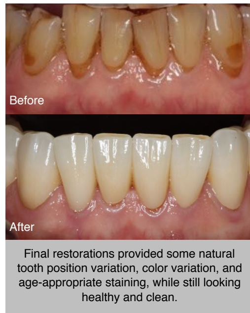
Final restorations provided some natural tooth position variation, color variation, and age-appropriate staining, while still looking healthy and clean.